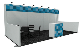
10'x20' Shell Scheme