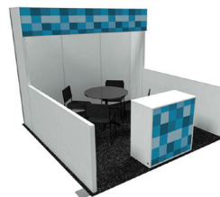
10'x10' Shell Scheme